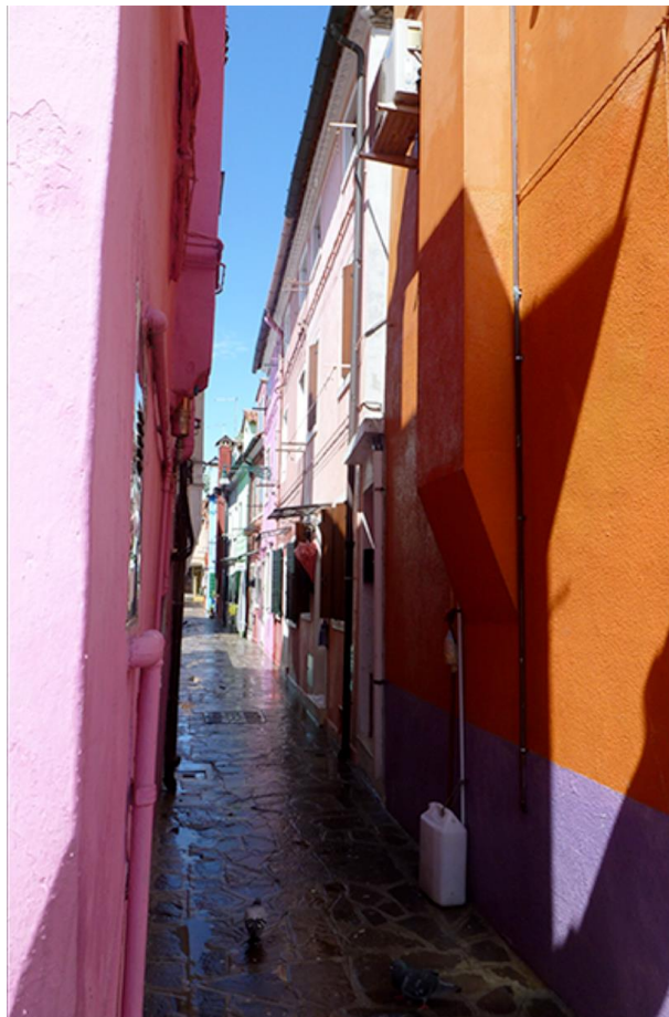
Figure 2: Burano Island (Venice): Narrow street. A sunny day after a storm.

Burano island is a particular case of the use of colour in the façades of buildings, a case begun around the 1960s with the sale of synthetic materials for painting of external façades. The colour choice was left to the discretion of individual owners who, in order to stand out in relation to their neighbours, have engaged in an uncontrollable competition by using different colours for their properties. A new reality has thus exploded with a considerable increase of the saturation of colours and the birth of combinations without rules. The recent widespread marketing of siloxane paints has further increased such saturation and the duration of colours. Also the application techniques have changed considerably and, if previously the wall painting was carried out directly by the owners, now there are professional painters who apply the products and often give advice on the choice of colours.