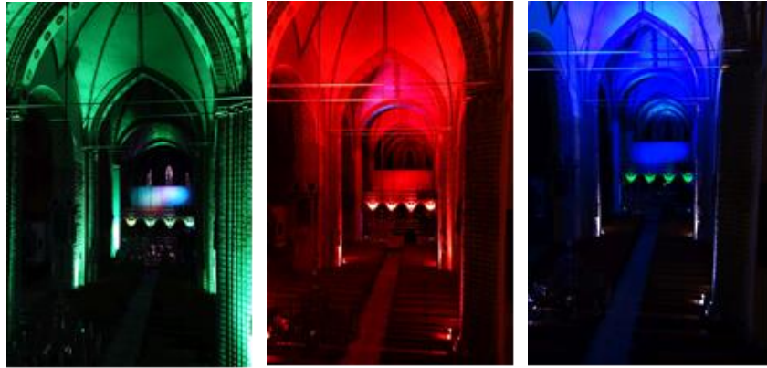
Figure 4: Photo sequence showing associative light atmospheres in the Cathedral of St. Peter, Schleswig © Gisela Meyer-Hahn.

I use colour and light dynamically in an associative as well as abstract way. A colour appearing in a new context may transport a different content at the same place at a later time. So, for example, green may—associatively—appear as the colour of nature and in a different context be the symbol for trust. Or red may represent love, but in another context stands for power, thereby it may respectively either centre the vision or make the room appear dark (see Figure 5).