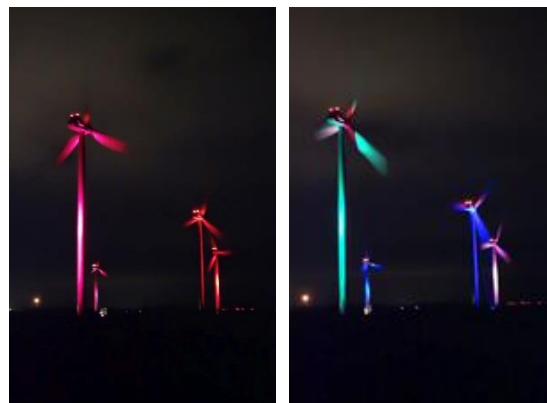
Figure 2: Ensemble of wind power plants in continually and slowly changing light © Gisela Meyer-Hahn.