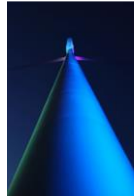
Figure 3: Tower of a wind power plant in blue light from close-up © Gisela Meyer-Hahn.

In proximity, colour was reflected by the tower and had a direct effect on the vegetative system. Rotational movement and sound became—in moderate weather—monotonous. It was easy to tolerate all colours.