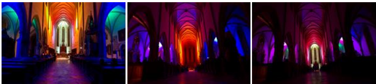
Figure 5: Photo sequence showing light transitions from a realisation in Dominican Church of St. Blasius, Regensburg © Gisela Meyer-Hahn, Photo: Jochen Vogel.

I use colour and light dynamically in an associative as well as abstract way. A colour appearing in a new context may transport a different content at the same place at a later time. So, for example, green may—associatively—appear as the colour of nature and in a different context be the symbol for trust. Or red may represent love, but in another context stands for power, thereby it may respectively either centre the vision or make the room appear dark (see Figure 5).